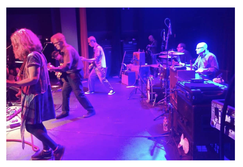
The Feelies performing their Velvet Underground set at White Eagle Hall in Jersey City.